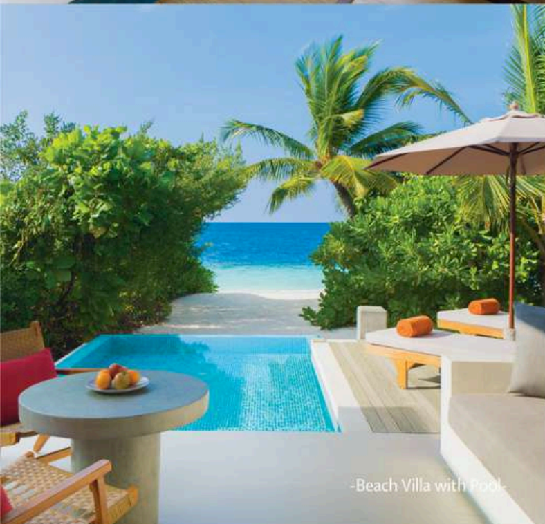
-Beach Villa with Pool-