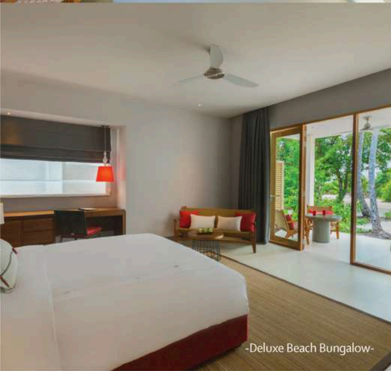
-Deluxe Beach Bungalow-