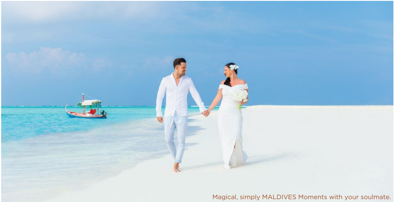
Magical, simply MALDIVES Moments with your soulmate.