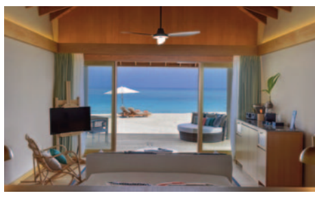
Beach Villas with Pool (172sqm) Total 20 Units – Pool 4x6m