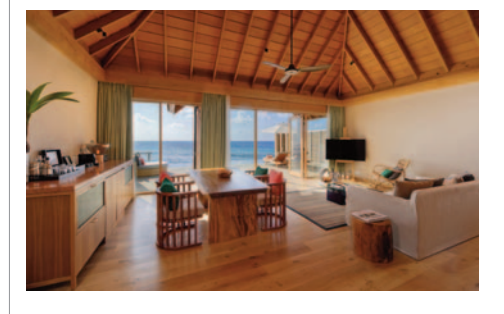
Presidential Beach Villa (351sqm) Total 1 Unit - Pool 12x5m