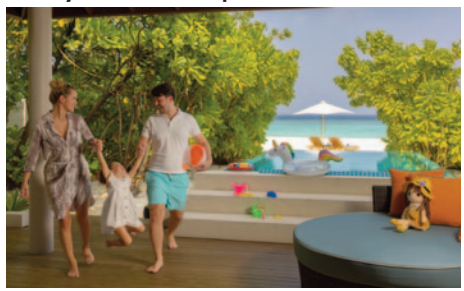
Water Villas with Pool (172sqm)

Total 7 Units - Pool 4x6m - two bathrooms