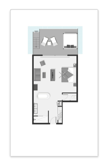
DDMB_DDME - Double room_Beach room