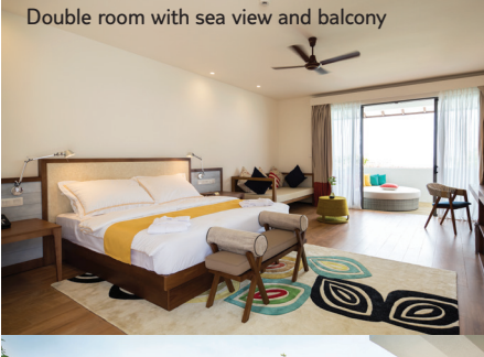
Double room with sea view and terrace