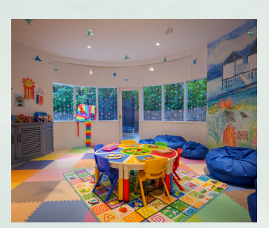
FARU - KIDS CLUB

Timing - 24/7 Trainer available between 0900 - 2100 hrs