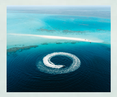
WATER SPORTS & DIVE CENTER

Timing - 0900 - 2100 4 Couple Treatement Room; Salon available